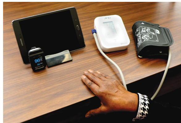
Patient at Home Tools take vital signs and personal surveys with monitoring services.

All of your readings are available to your doctor in real time. This helps you get better healthcare.