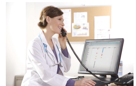
Telehealth Nurse Custom software that provides the nurse with vital sign readings and allows for you to get help sooner.